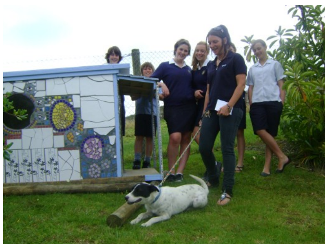
Checking out the new kennel!